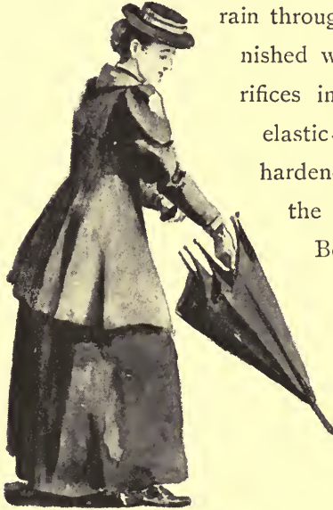
"We retired into the rain."

with two red comforters, such as are worn by virtuous woodmen in coloured almanacs, and with a bag of biscuits (bought at the opposite counter), we retired into the rain through a doorway gar- nished with alarming sac- rifices in flannelettes and elastic-sided boots, and hardened our hearts for the road.